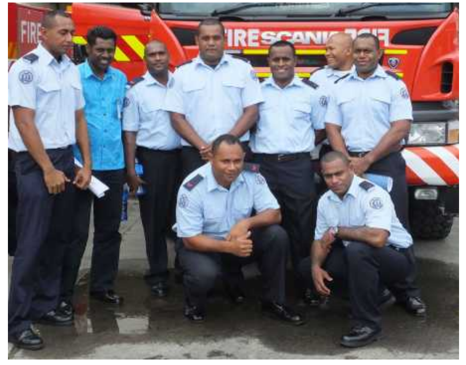
Participants of the OHS Training Course at the NFA Headquarters

National Fire Authority (NFA) staff in the Central/ Eastern and Northern Division Fire Stations attended the Occupational Health and Safety Module 1 & 2